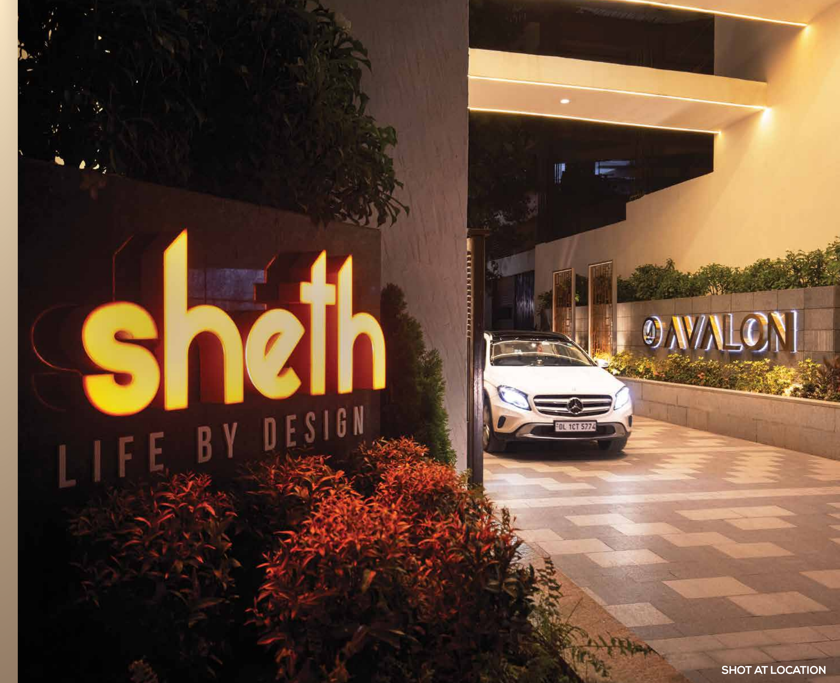
SHOT AT LOCATION